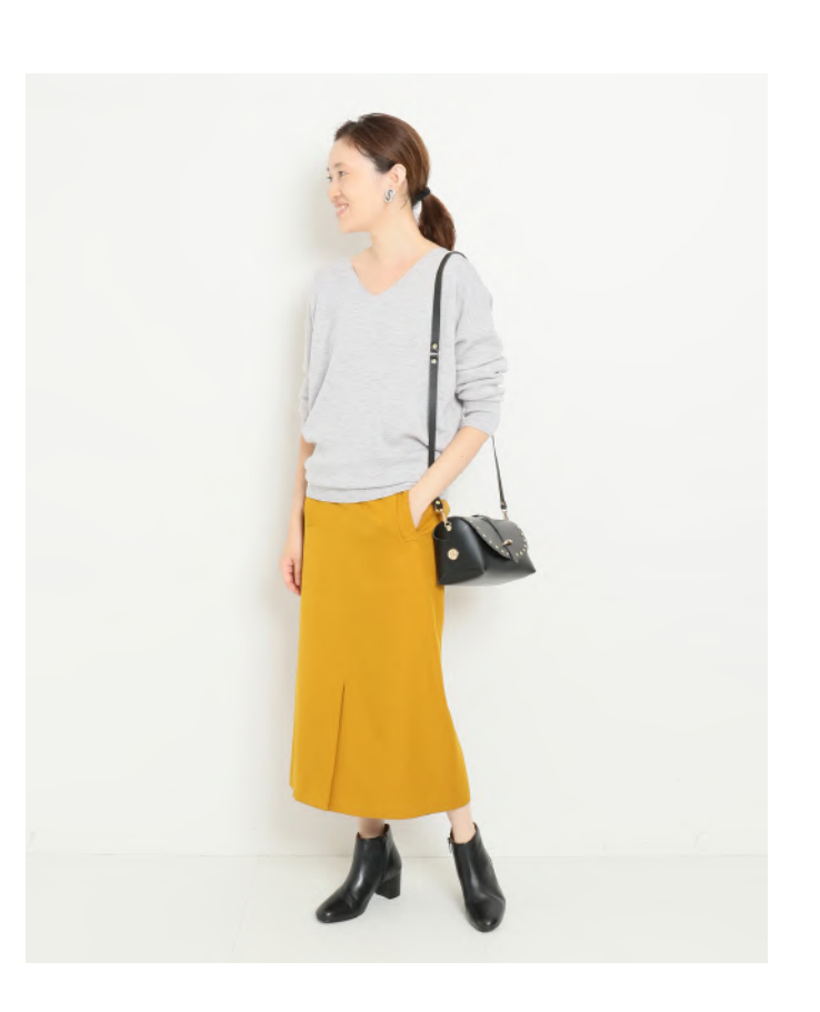
SLOBE IENA / Side pocket skirt 6,930 yen (tax included)